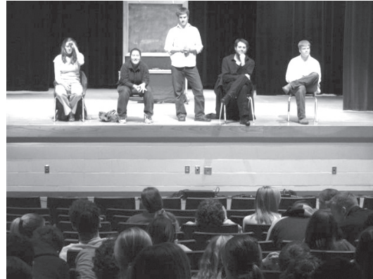
MACBETH at LHS