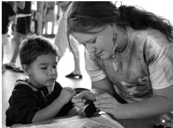
The Youth Art Exhibit- student artists help children make art